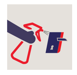
Clean and sanitize all frequently touched surfaces