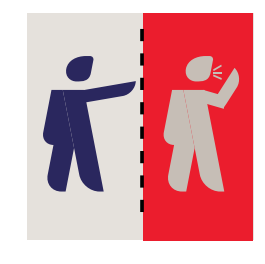
Keep a safe distance (6 feet) from people who are coughing/sneezing