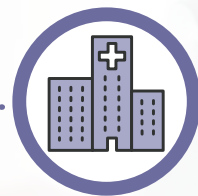
Infrastructure & Equipment

With Circles, you have the support to meet changing needs with agility and confidence